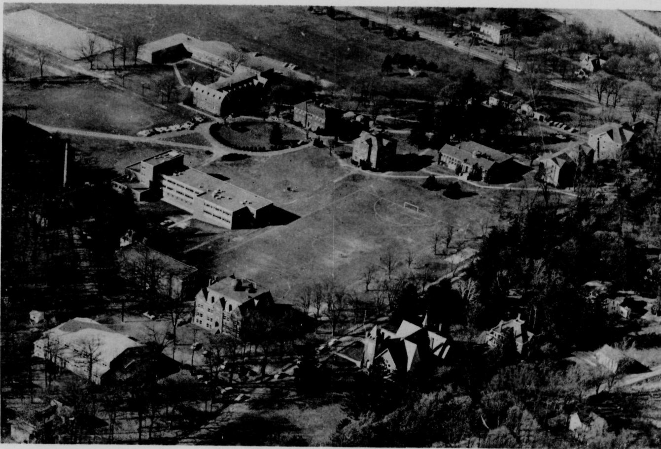
Aerial View of the Campus